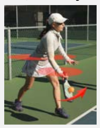
Figure 4-3(legal serve)