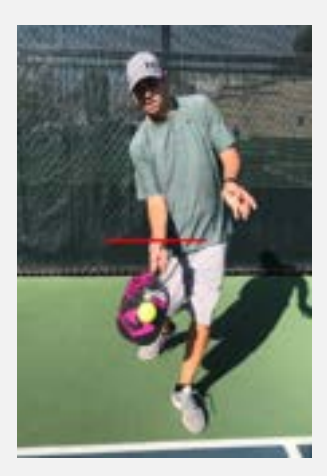
Figure 4-1(legal serve)