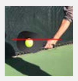
Figure 4-2(illegal serve)